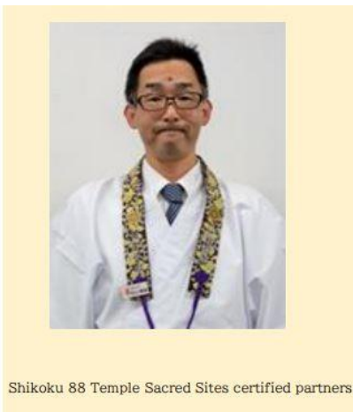
Shikoku 88 Temple Sacred Sites certified partners